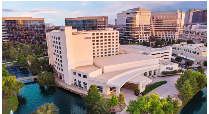
HILTON DALLAS/PLANO GRANITE PARK