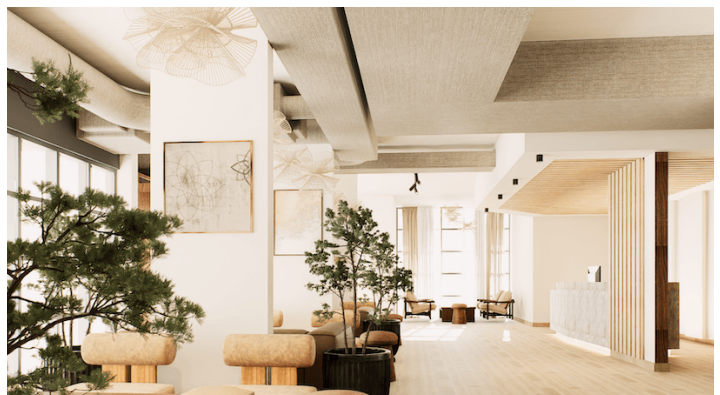
THE CLARA HOTEL PLANO, TAPESTRY COLLECTION BY HILTON