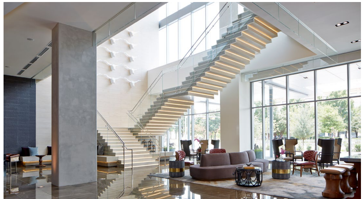
RENAISSANCE DALLAS AT PLANO LEGACY WEST HOTEL