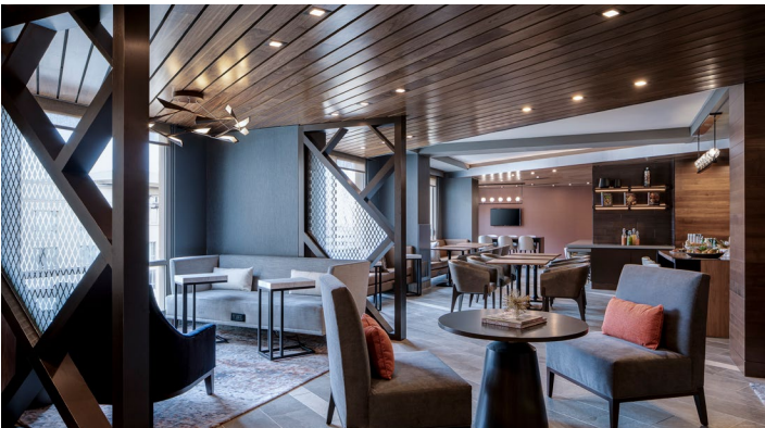
MARRIOTT DALLAS/PLANO AT LEGACY TOWN CENTER