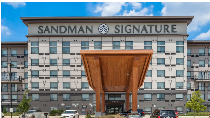
SANDMAN SIGNATURE PLANO-FRISCO HOTEL