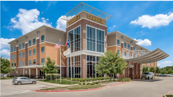
CAMBRIA HOTEL PLANO-FRISCO

With 60 hotels and 7,555 hotel rooms available, Plano has everything from approachable family options to the ultimate in luxury accommodations. Visit Plano's website includes a complete list of hotel options. A few of the most notable options include: